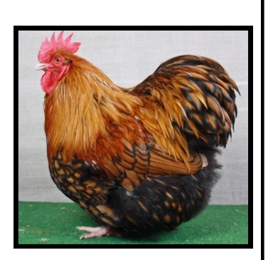
Pictured adjacent are two fine examples of Gold Laced Bantams, owned by the breed's creator Herr Axel Harlos (Germany.) Both were exhibited at Schleife Show in 2014.The male wasGraded hv96, the female v96.